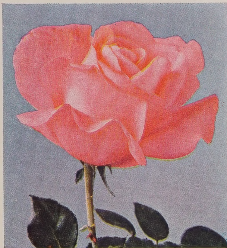
THE DOCTOR—$1.00 each; 3 for $2.50

THE CHIEF —Plant Pat. No. 456. The color of the bud varies with the weather from deep rose to flame, opening to a magnificently full flower of flame, coral and copper, changing to a beautiful shade of orange-pink as the flowers age. The blooms are borne singly on exceedingly long stems with plenty of thick, heavy, lasting petals. Rich fruity fragrance. A spreading vigorous plant remarkably resistant to mildew. $1.25 each, 3 for $3.15.